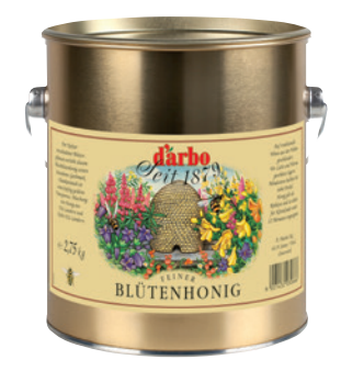
Darbo Honey 2.75 kg can

Our practical 500 g honey dispensers are guaranteed easy and clean to use, which makes them the ideal solution for your breakfast buffet. Matching display stands also create an attractive feature on your breakfast buffet.