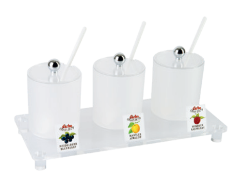
Transparent display stand for acrylic pots of fruit spreads from large tubs (Art. No. 039232)