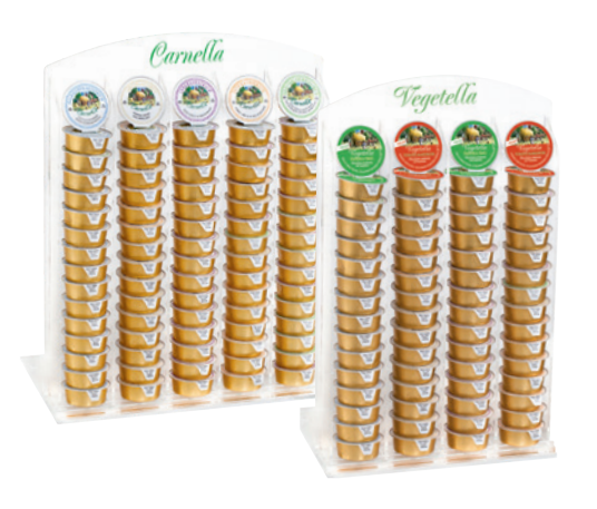
Transparent display stand for Carnella meat spreads ( Art. No. 041631 ) or Vegetella soya-based vegetable spreads ( Art. Nr. 048258 )