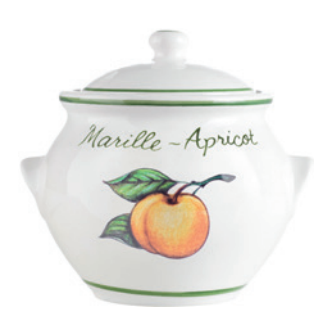
Ceramic pot Available for various products