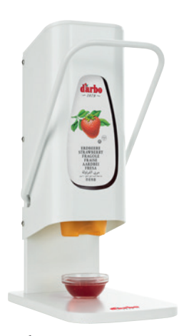
White - Art. No. 049101 Black - Art. No. 050459