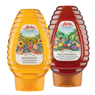
Darbo Honey 500 g dispenser

This product is only available in Austria.