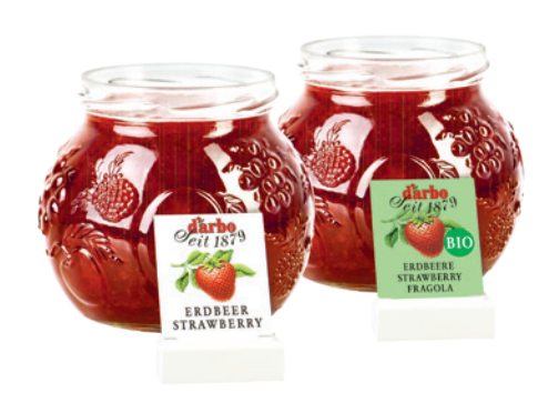
White label holder – a flexible, space-saving solution without white display stands (Art. No. 045394)