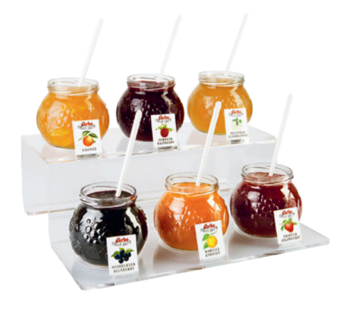
Transparent display stand for 6 x 640 g decorative jars ( Art. No. 044427 )