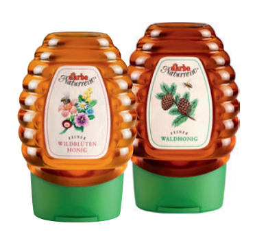
Darbo Honey 300 g dispenser

Honey fans will be spoilt for choice with the wide range of Darbo honeys. Each variety has its individual characteristic flavour – including mild, mellow, flowery, sweet, tangy and bitter. Several decades of experience in the selection, procurement and bottling of honey makes Darbo a reliable choice.