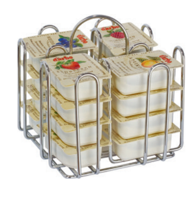
Table-top display stand for 14 g and 25 g individual portions (Art. No. 051128)

Table-top display stand for 28 g mini jars (Art. No. 033377)