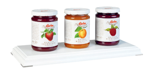
White display stand for 450 g preserves (Art. No. 045363)