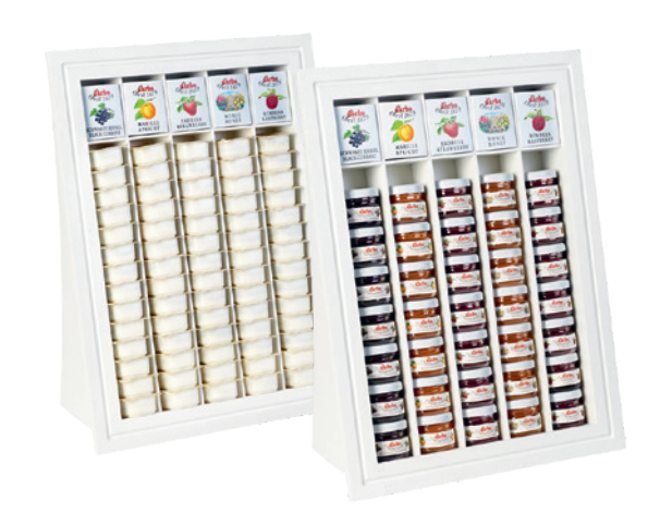
White display stand for 28 g mini jars or 14 g and 25 g individual portions (Art. No. 045332)