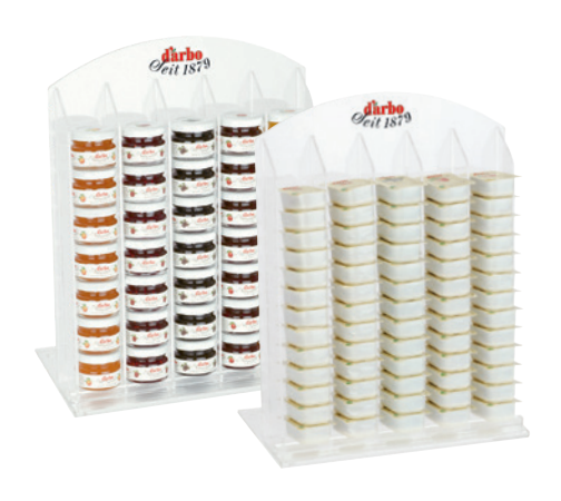
Transparent display stand for 28 g mini jars or 14 g and 25 g individual portions (Art. No. 038754)