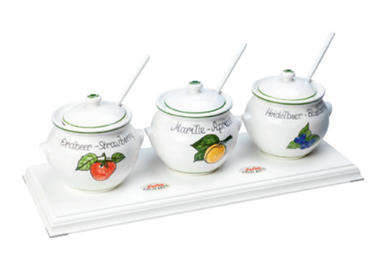
White display stand for ceramic pots of fruit spreads from large tubs (Art. No. 045356)