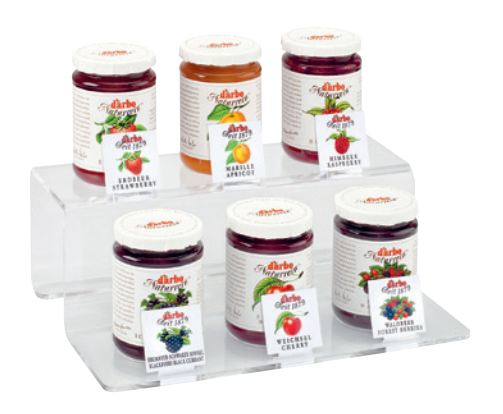
Transparent display stand for 6 x 450 g preserves or 6 x 500 g honey ( Art. No. 045233 )