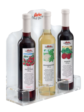
Transparent display stand for 0.5 l syrups (Art. No. 040726)