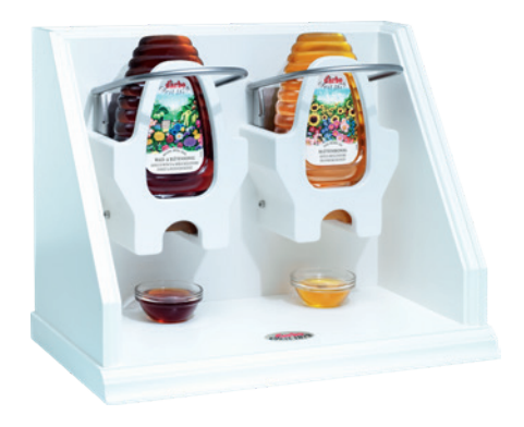
White display stand for 500 g honey dispensers (Art. No. 047152)