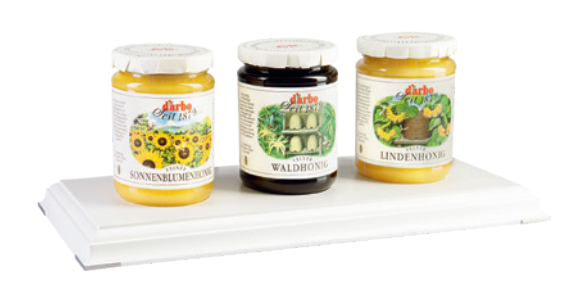
White display stand for 500 g honey (Art. No. 045363)