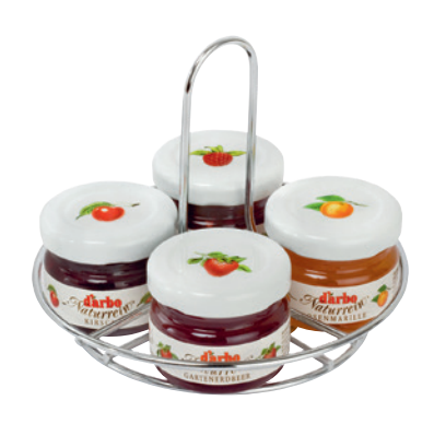
Table-top display stand for 28 g mini jars (Art. No. 033377)

The range of Darbo display stands comprises two metal models for Darbo 28 g min jars and for 14 g or 25 g individual portions. Both of these metal display stands are perfect for displaying our products on the breakfast table and for room service.