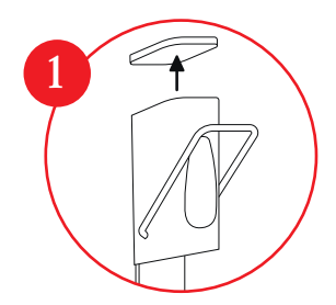
Open top of dispenser