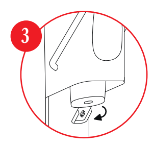
Flip open cap