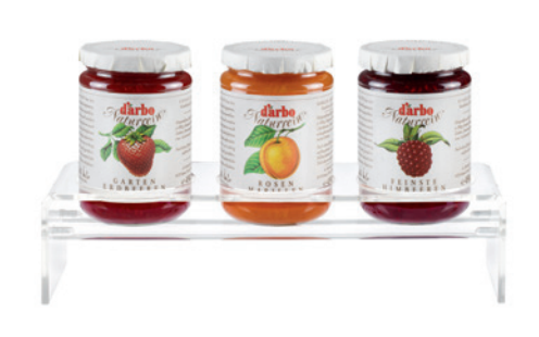
Transparent display stand for 450 g preserves or 500 g honey (Art. No. 041624)