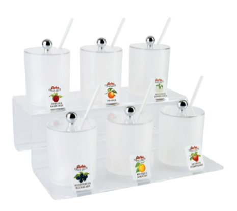
Transparent display stand for 6 acrylic pots of fruit spreads from large tubs (Art. No. 044427)