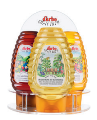
Transparent display stand for 3 x 500 g honey dispenser (Art. No. 047992)