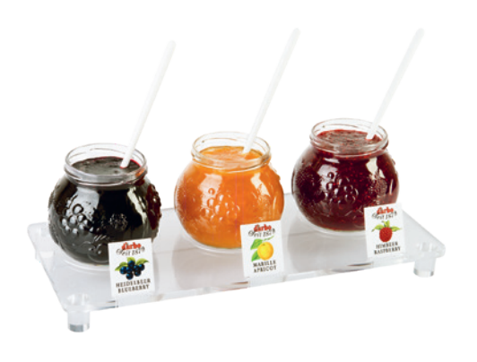
Transparent display stand for 640 g decorative jars (Art. No. 039232)