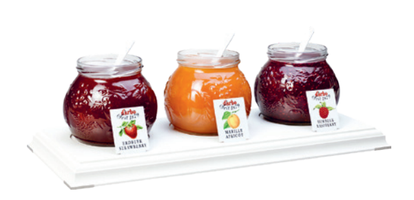
White display stand for 640 g decorative jars (Art. No. 045387)