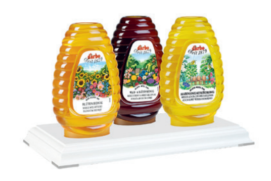
White display stand for 300 g and 500 g honey dispensers (Art. No. 045370)