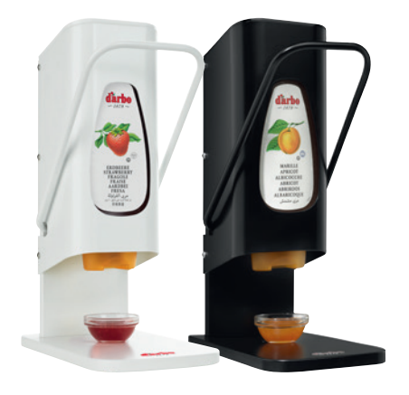
White Dispenser (Art. No. 049101) or black dispenser (Art. No. 050459) for 880 g, 900 g and 1000 g dispenser bottles