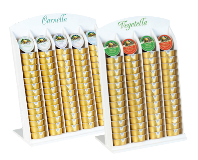
White display stand for Carnella meat spreads (Art. No. 045349) or Vegetella soya-based vegetable spreads (Art. Nr. 048227)