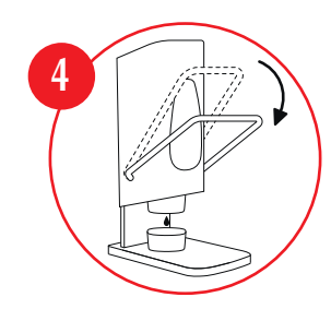
Push lever downwards