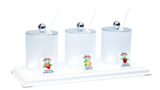
White display stand for acrylic pots of fruit spreads from large tubs (Art. No. 045387)