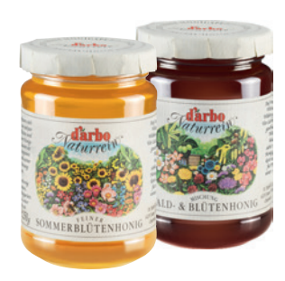
Austrian product packaging