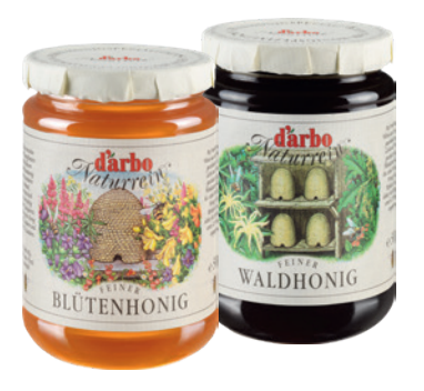
Austrian product packaging

This honey in its handy 250 g jar is ideal for small households. You can choose between a mild summer blossom honey and a tangy mix of forest and blossom honey. Depending on your preference, both honeys can be perfect on fresh bread, in muesli, in a dessert or as a sweetener for your tea.